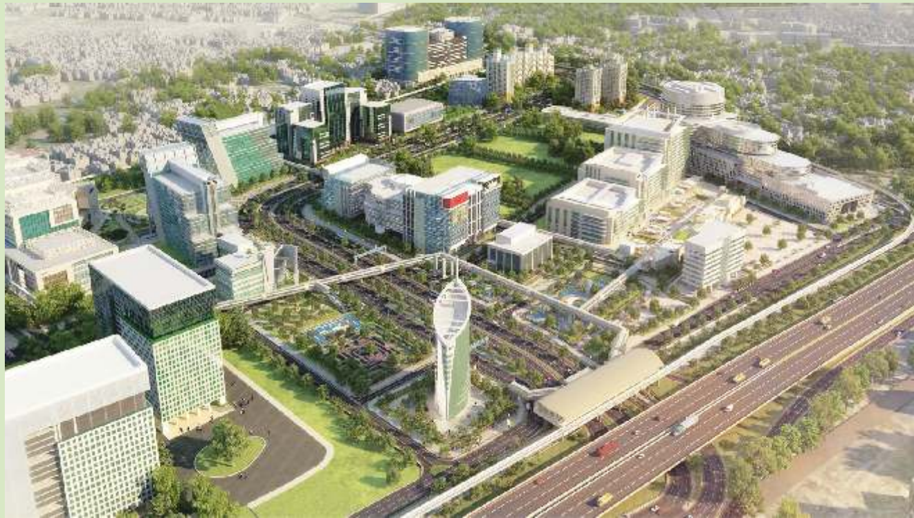
Cyber City (SEZ) Gurgaon - 2017

Imagine The Future Growth Near Mahindra World City - Ajmer Road Jaipur