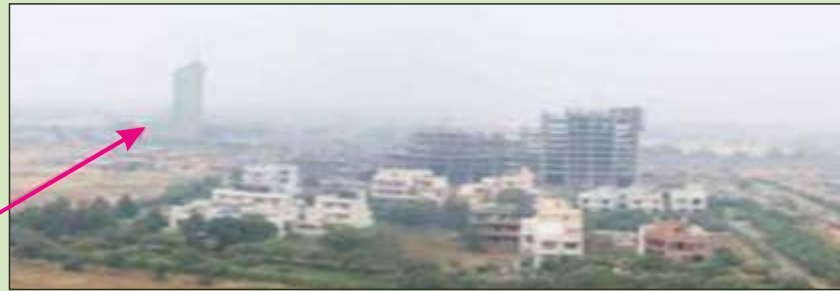
Cyber City (SEZ) Gurgaon-2003