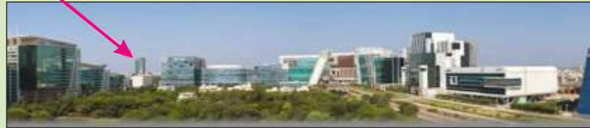
Cyber City (SEZ) Gurgaon-2014