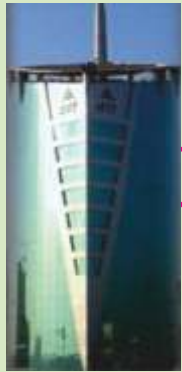
DLF Gateway Tower